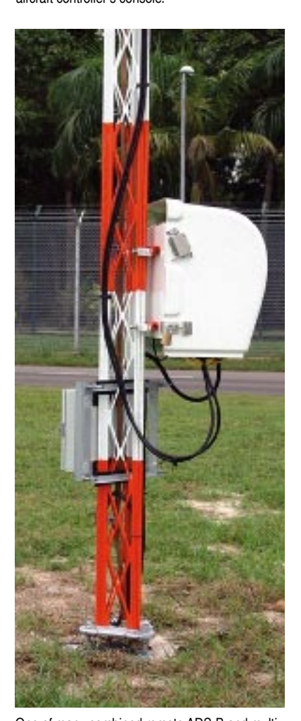
One of many combined remote ADS-B and multilateral receivers installed at equipped airports.