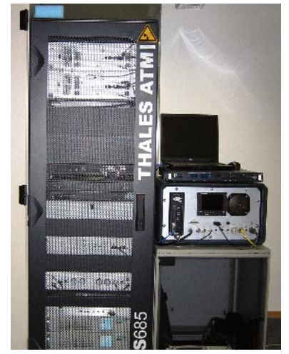
This data concentrator sends information to an aircraft controller's console.