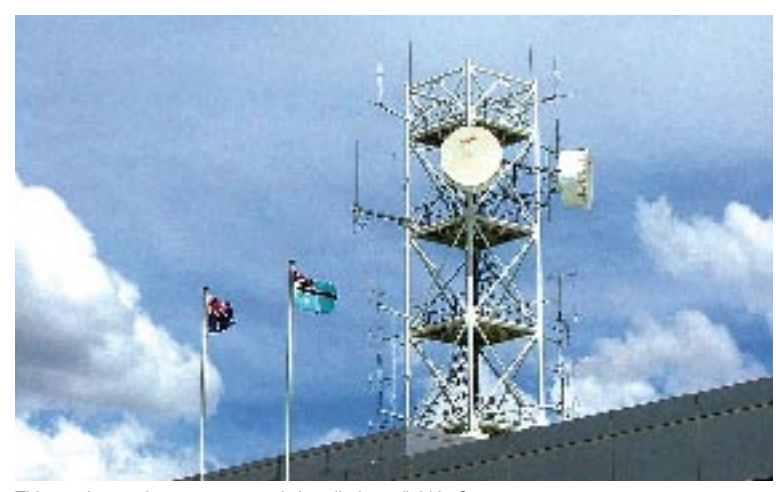
This receiver and antenna system is installed at a field in Germany.

This antenna is utilized for combined ADS-B and multilateral receivers.