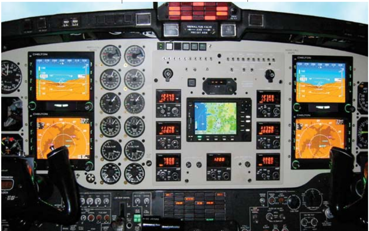
Four-screen install on a King Air 300