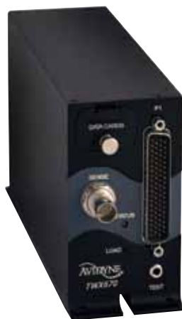
Avidyne's TWX670 tactical weather detection system

"Of the three systems, data-link is probably the easiest to use — it's the most intuitive," LaConto said. "It's just like watching 'The Weather Channel.'