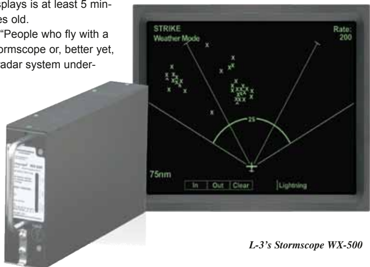
L-3's Stormscope WX-500

"I think data-link is definitely a complement to an on-board system — not a replacement. The ideal situation is to use all three systems in combination to get a more accurate presentation of the weather," he said. "Sometimes, amongst the users, there can be an over-reliance on the data-link weather. That's one thing we